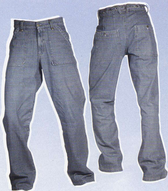
dweller 151252 color: vintage blue