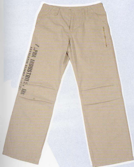
man's field 151214 colors: washed stone, washed black, washed olive