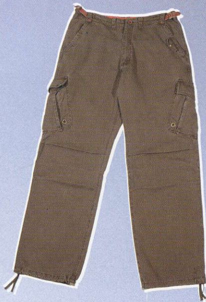
rambler 151213 colors: washed brown, washed black, washed sand