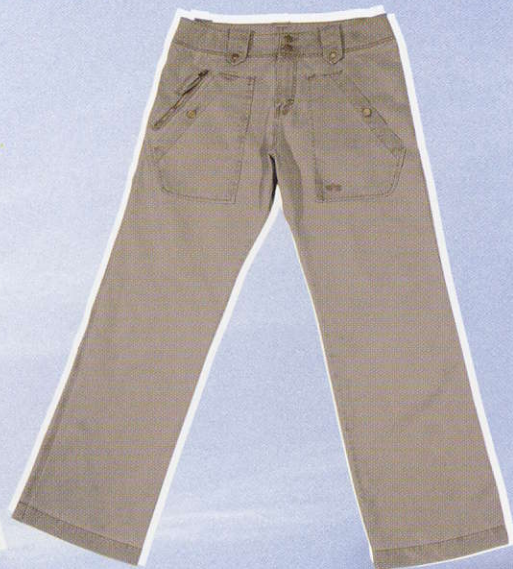
deck pant 151211 colors: washed stone, washed brown, washed olive