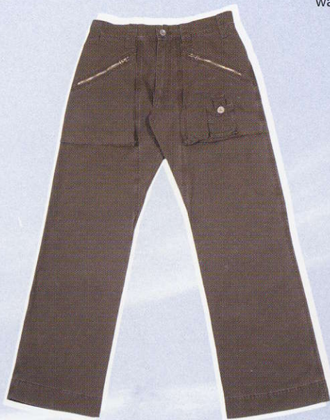
eagle 151212 colors: washed black, washed brown, washed stone