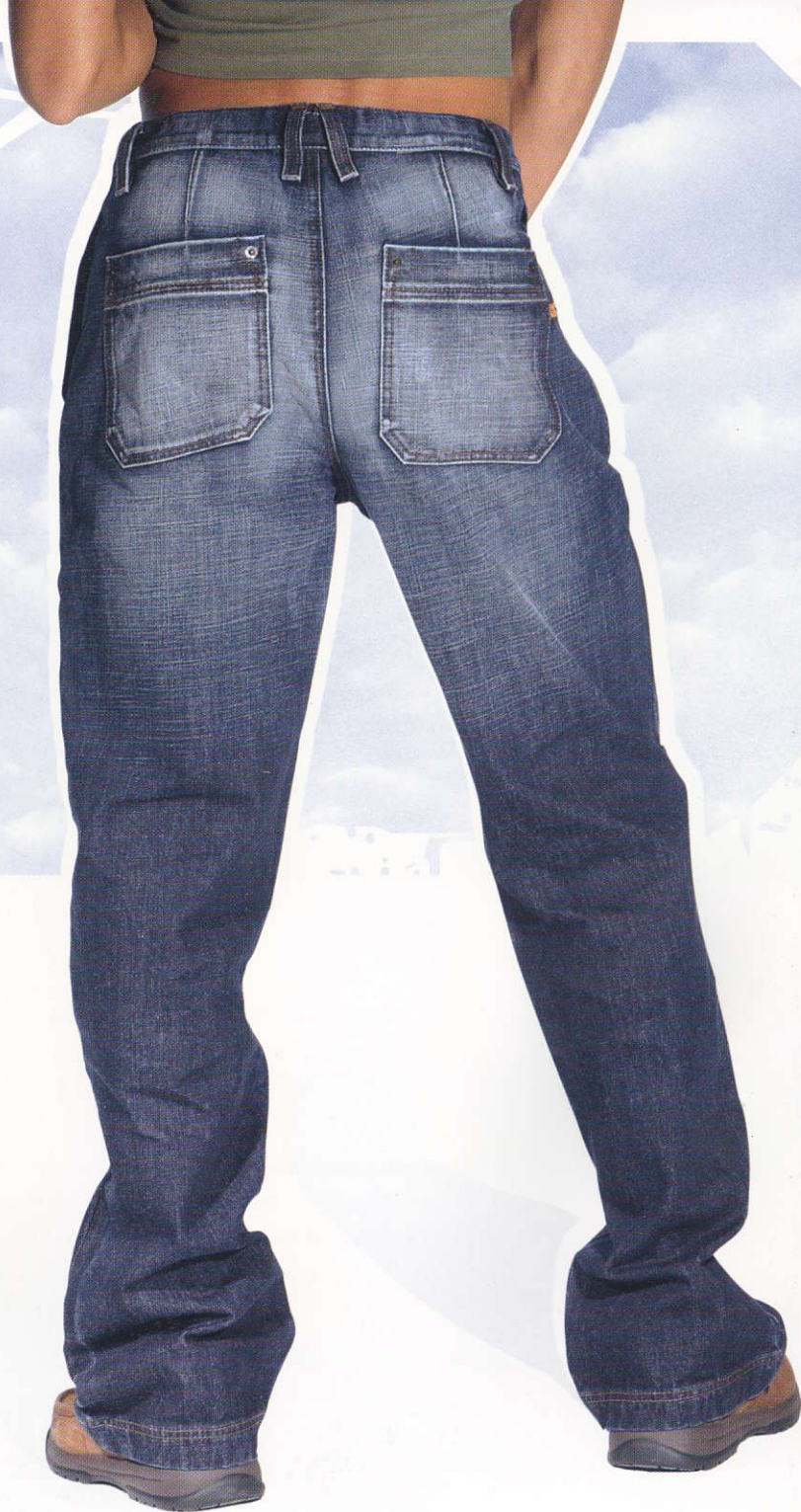
mariner 151251 color: brushed blue